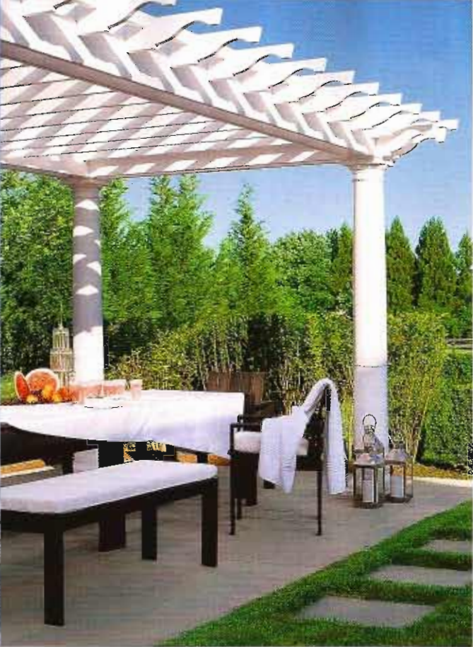
THESE PAGES: Upper and lower porches span back of house. Pergola for alfresco dining. Gentle steps extend length of 40-foot pool and descend from checkerboard terrace in setting where strict geometry orders space. West Elm chaises and chairs with white cushions in Sunbrella fabric. Louis Ghost chairs by Philippe Starck. Custom banquettes against house. Custom hot tub. Tent pavilion by Frontgate. Wood-burning fireplace.